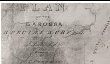
Land Titles Office