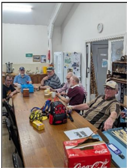
A day in the life of the Men's Shed