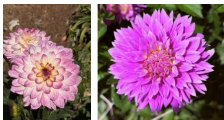
Front cover: Carlos Watermelon Dahlia