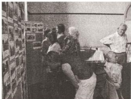
Back-to-Lyndoch Revisited 2001