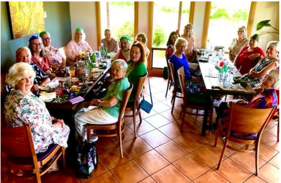
Coffee & Chat group Christmas Lunch at the Monkey Nut Cafe