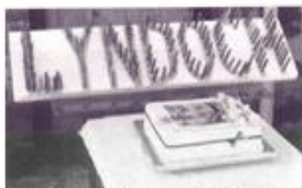
Lyndoch's 160th Anniversary Cake & Candles