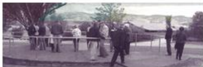
Directional Dial and Railing Enclosure (Public Cemetery)