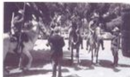
Boer War Centenary Celebrations