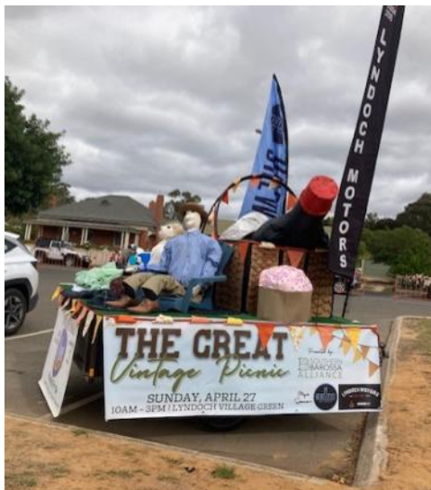
Some photos taken at the GREAT VINTAGE PICNIC 2025