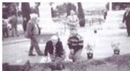
Lyndoch Ex-Service People planting roses