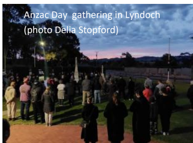
Anzac Day gathering in Lyndoch