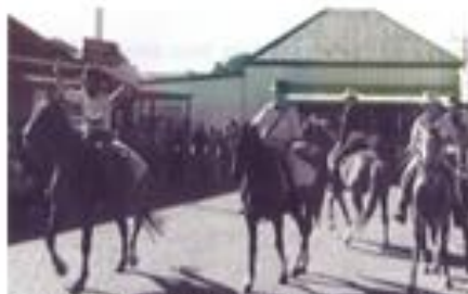
Re-enactment of Light naming Lyndoch Vale