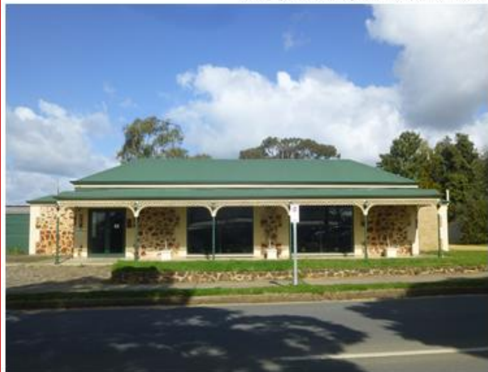
Known previously as Red Room, and later as 1 on Gilbert Function Room