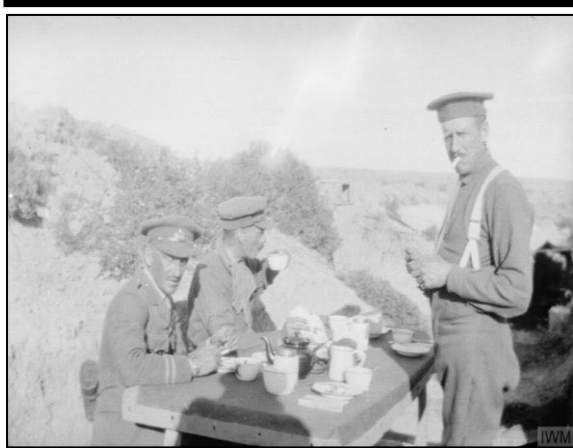
Left: British Traditions – Officers of the Royal Naval Division enjoying a cup of tea at Gallipoli.