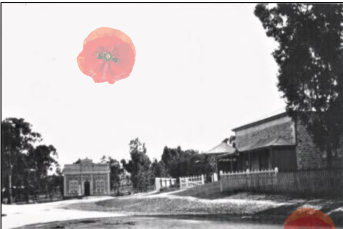
Above: Main Street, Williamstown. Circa 1916.