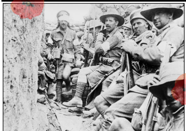
Above: 1 st Battalion troops waiting near Jacob's trench for relief by 7 th Battalion. Circa 8 th August, 1915.