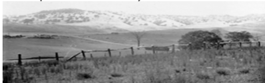
20th Century – Snow on the Barossa Range 1901

A pamphlet looking at the development of the participation of women in the Lyndoch community during the first half of the twentieth century (1901 - 1950) will be on sale. It is interesting to see how the two World Wars assisted the women in replacing the local men who were away serving in the various theatres of war. The Society's Museum will be open and there will be members available to provide assistance with family research as well.